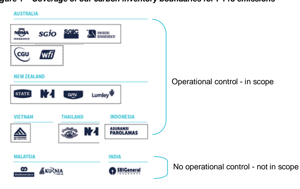
Figure 1 – Coverage of our carbon inventory boundaries for FY18 emissions

IAG's Australian and New Zealand operations and Asia head office fall into the scope of the FY2018 carbon inventory, as does the Indonesian, Thai and Vietnam businesses we held interests in during the FY18 period. IAG's joint venture operations in India and Malaysia are out of scope (see Figure 1)<sup>2</sup>.